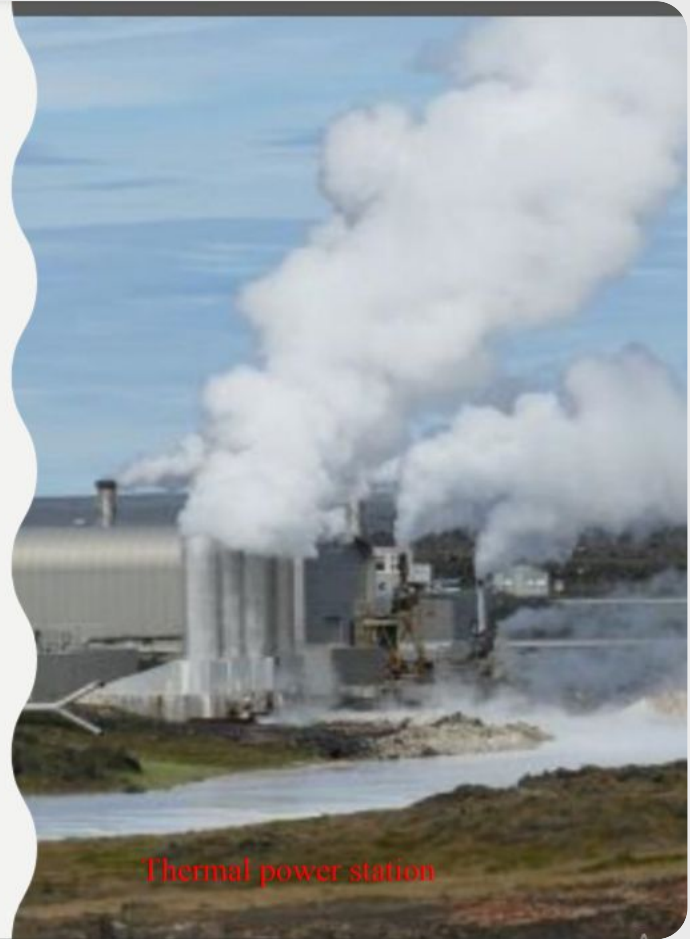
Thermal power station